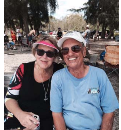
And laughter was heard everywhere.