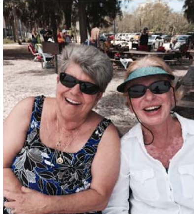
Old friendships were rekindled...