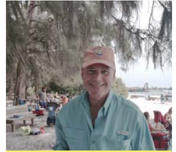
Everyone was smiling after they filled their stomachs with the great food that was available.