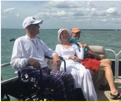
Over the waves and to the beach we go!