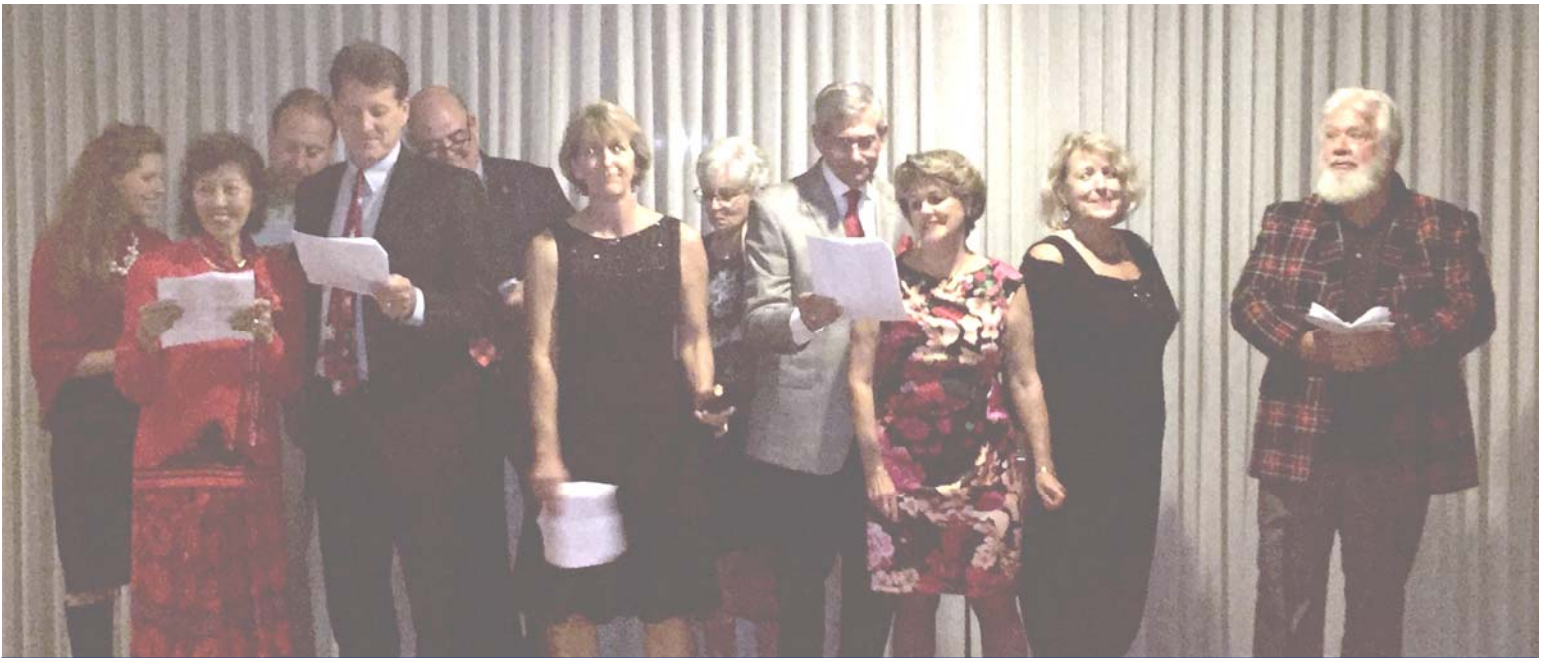
ROTARY SINGERS AT THE 2017 HOLIDAY PARTY — AFTER THE COCKTAIL HOUR.