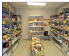
School Based Food Pantries